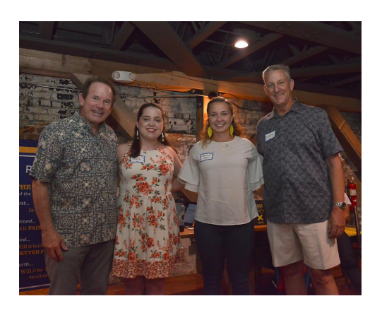
Rotary Dates to Save This is Where the Magic Happens. Will You Join Us?