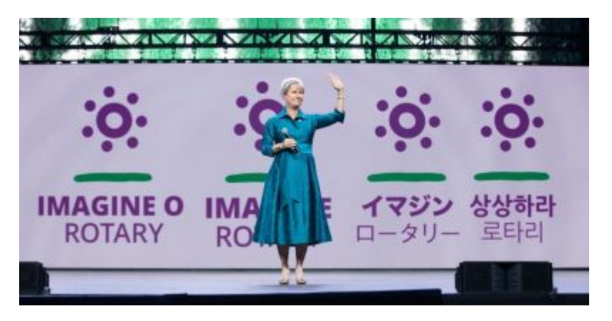
May 4-6 International Peace Conference

Looking forward to the 2023 International Peace Conference on May 4-6 right here in the heart of the South! This conference will feature over 80 speakers from across the globe who will speak on topics such as human trafficking, reducing violence in our communities, education, social justice, empowerment of women and much more. The Human Trafficking program is particularly strong, bringing many of the best presenters encountered working on this issue.