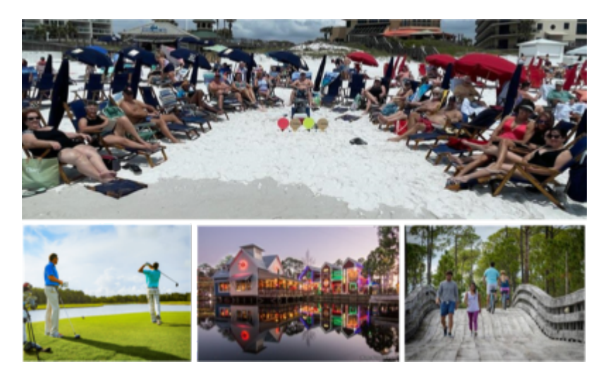
April 27 - 30 District Conference -Sandestin, Florida

After an evening in the best hospitality suite...what to do? The Beach...Did someone say the Beach ??