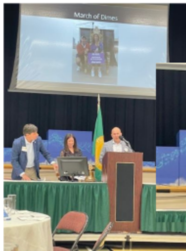
Last Week at Rotary